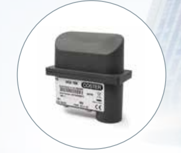
DATA CONCENTRATOR UCD708