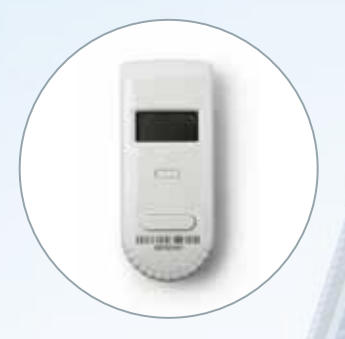
HEAT ALLOCATOR RPC301/311