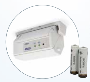
SIGNAL REPEATER RTR 301